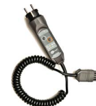
WS-03 adapter with START button with UNI-Schuko plug (CAT III 300 V)