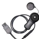
LP-10B light meter probe with WS-06 plug