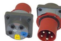
Three-phase socket adapter 63 A