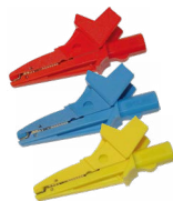
Crocodile clip 1 kV 20 A red / blue / yellow